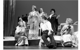
La Rondine, 2022

W elcome to our 17th season! We are so proud to be able to continue our mission of bringing opera to St. Louis in the Winter months. Last season was fantastic, ending on a high note with a sold out performance of The Desert Song . The Kirkwood Performing Arts Center has proven to be a huge asset to our organization, as we have been gaining new patrons from the new theater.