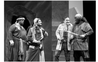
The Desert Song, 2023

Our exponential growth and the ending of our lease in November of 2024 has created the need for us to move our offices on The Hill. We are currently looking for a new home for our costume & alterations shop, offices, rehearsal spaces and warehouse. If you know anyone selling a building with 15,000 to 20,000 square feet or have any connections in that area, we would appreciate your help. Our goal is to continue to expand and serve our community. Thank you for your patronage and commitment to Winter Opera St. Louis. We love being a part of your lives.