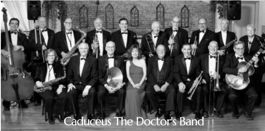
Caduceus The Doctor's Band