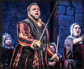
Il Trovatore • 2016