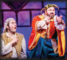
Yeomen of the Guard • 2015