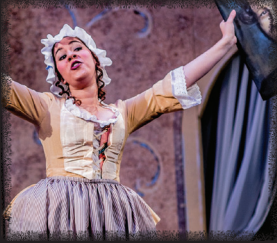
Costi fan tutte • 2016