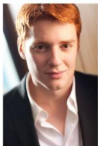
ISAIAH BELL Opéra de Montréal Calgary Opera